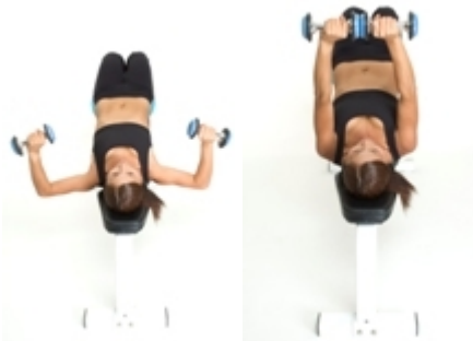
Decline Chest Press

Start- Begin by laying on a decline bench. Place your feet and knees so that you are most comfortable. Allow your head to lay back on the bench. This will support your spine and neck. Hold a dumbbell in each hand. Palms facing away from you.