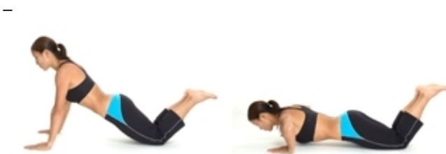
Knee Push Ups

Start- Begin on all fours. Your knees should be directly under your hips and your hands directly under your shoulders. You should be looking at the floor.