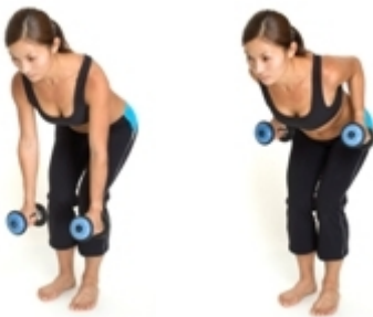
Bent Over Row

Start- Stand with your feet under your hips and knees slightly bent. Hold a free weight in each hand, palms facing each other, arms relaxed. Bend forward from your hips and keep your back as flat as possible. Your head and neck are in line with your spine.