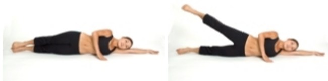
Lying Side Leg Raise

Start- Begin by lying on one side. Keep your body as straight as possible. Place your hands where they