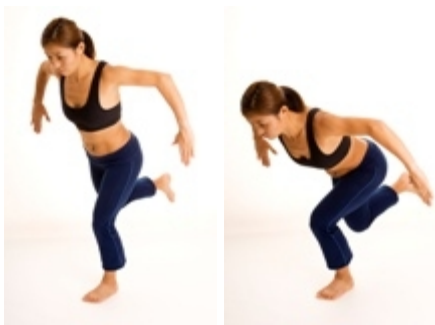
One Legged Squat

Start- Begin with your feet directly under your hips and hands by your sides. Lift your left leg so that it is behind you.